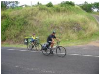
A BBTA cyclist who will remain nameless