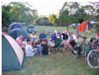
By the end of Day One -

was cycling up the hill with me and it could have been just conversation but the cyclist asked 'How many kilometres until we have morning tea?'