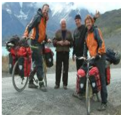
At Torres Del Paine National Park

launch an adventure-based educational curriculum that can be taught in schools up to year 10.